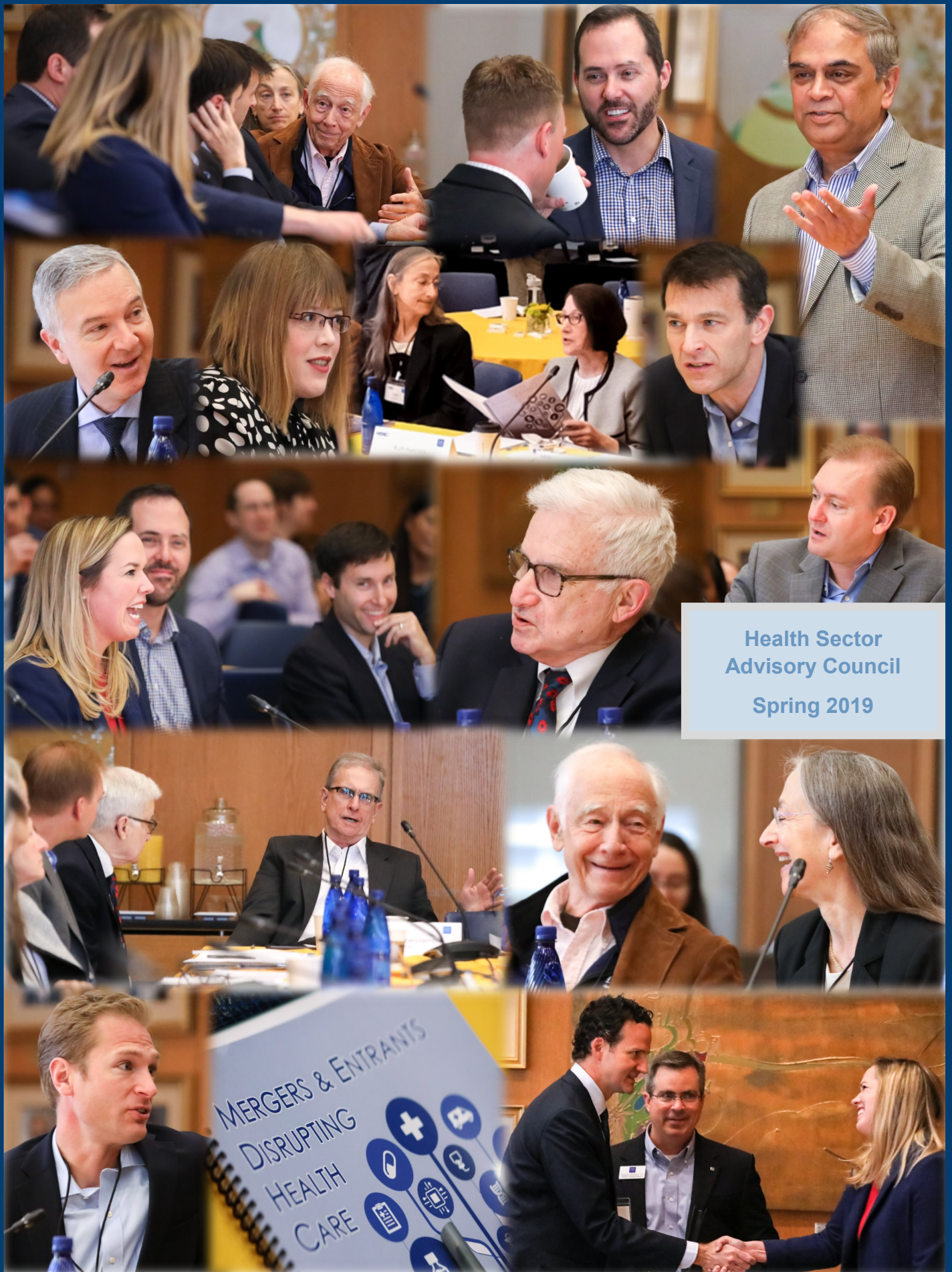
Health Sector Advisory Council Spring 2019