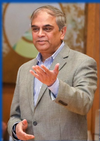
Photos from past HSAC Meetings