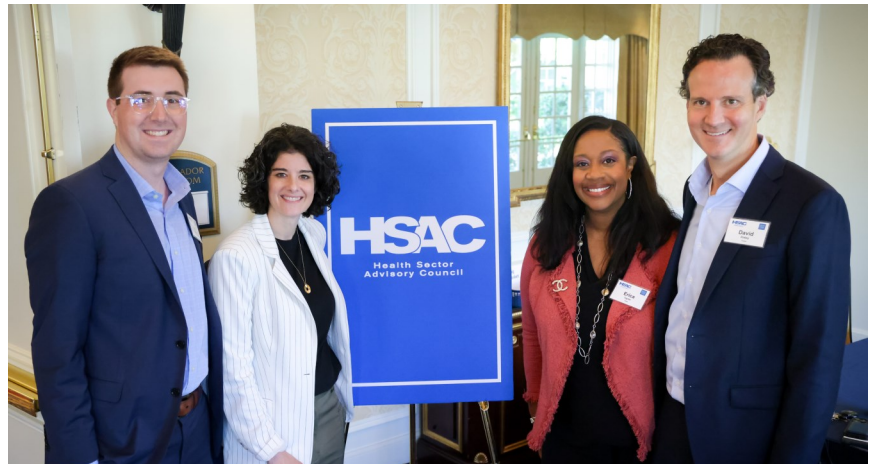
HSAC Spring 2024: Developed @ Duke